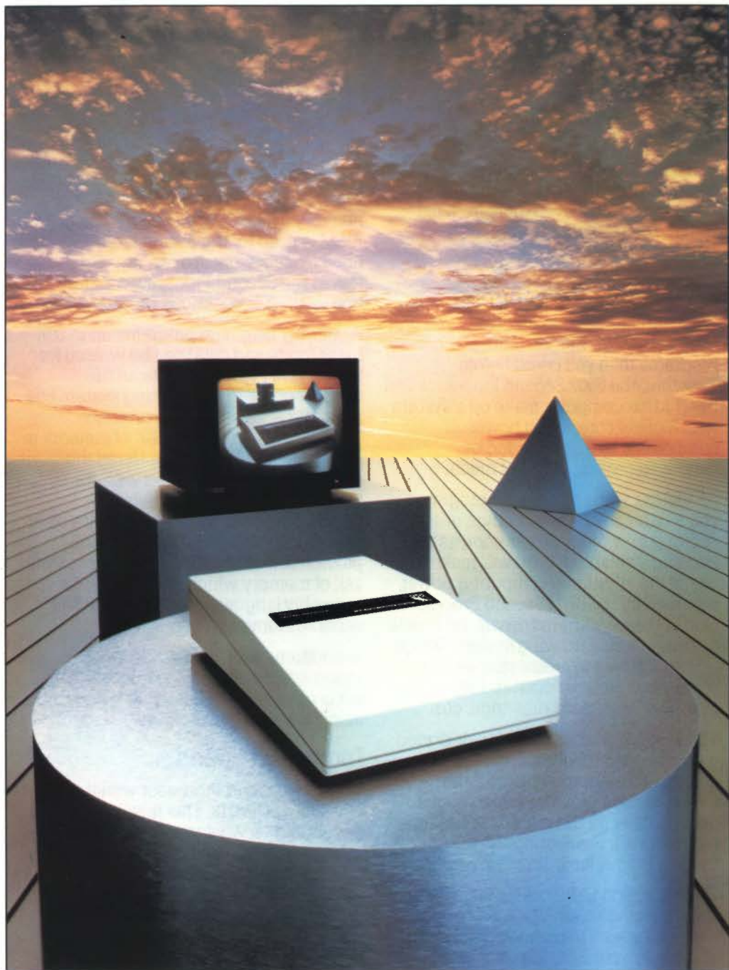
The British Broadcasting Corporation Microcomputer 6502 Second Processor